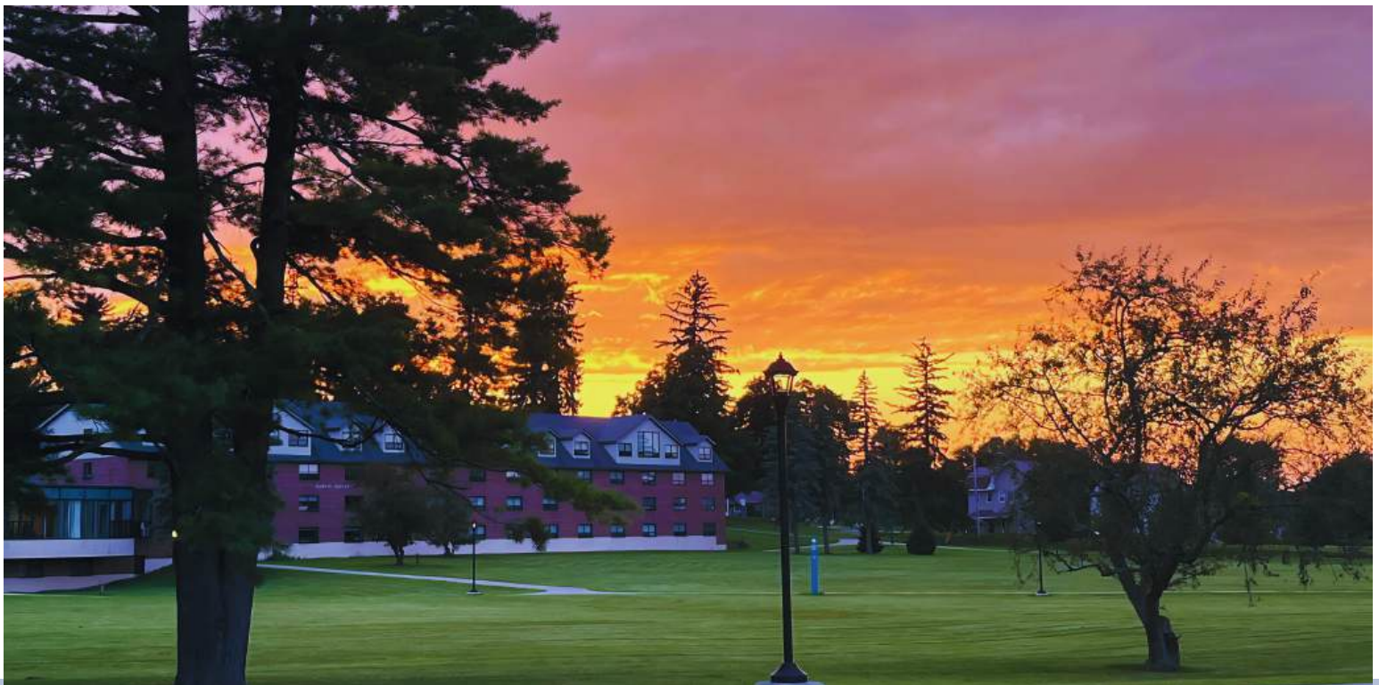
Sunset over Clarkson