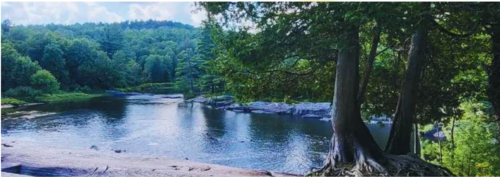
Lampson Falls Trail