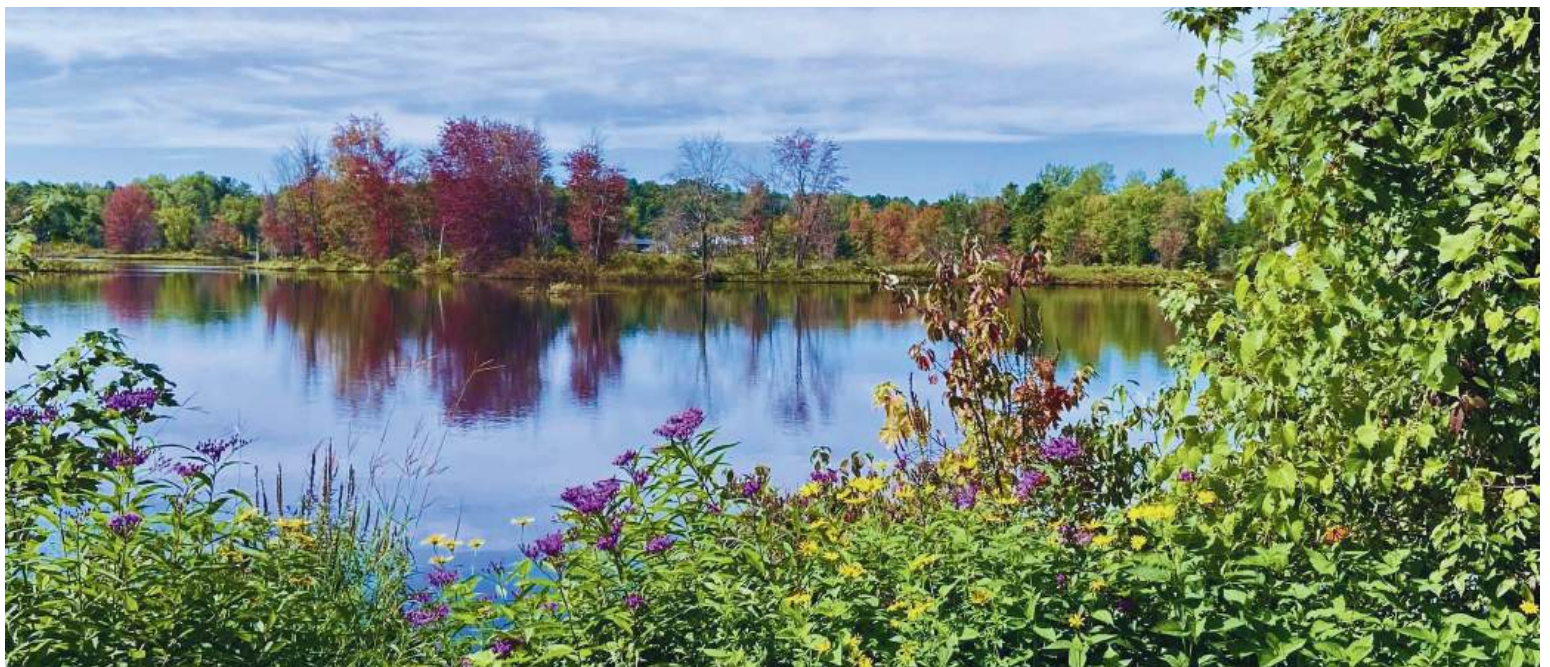
Ives Park, Potsdam